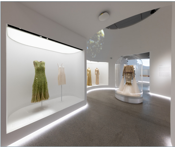
Sleeping Beauties: Reawakening Fashion (2024)

Mr. Bolton has received numerous awards, including the Fashion Group International Superstar Award in 2023 and Oracle Award in 2016; the Vilcek Prize in Fashion in 2015; the Best Monographic Exhibition from the Association of Art Museum Curators for Alexander McQueen in 2011; and the Richard Martin Award for Excellence from The Costume Society of America for American Woman in 2010 and also for Poiret (with Harold Koda) in 2007. In June 2023, he became an Officer of the Most Excellent Order of the British Empire (OBE).